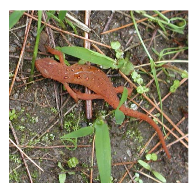
The Ethel Walker Woods contains numerous vernal pools, critical to the breeding success of the many reptiles and amphibians that inhabit the property—including the Red-spotted newt shown above.

With its rich set of forests, wetlands, meadows, streams, and floodplains, the Ethel Walker Woods contains exceptionally diverse wildlife habitat. This includes extensive stands of mature conifers, which support over 60 species of forest-nesting and migratory birds and impressive densities of northerly or higher elevation bird species. According